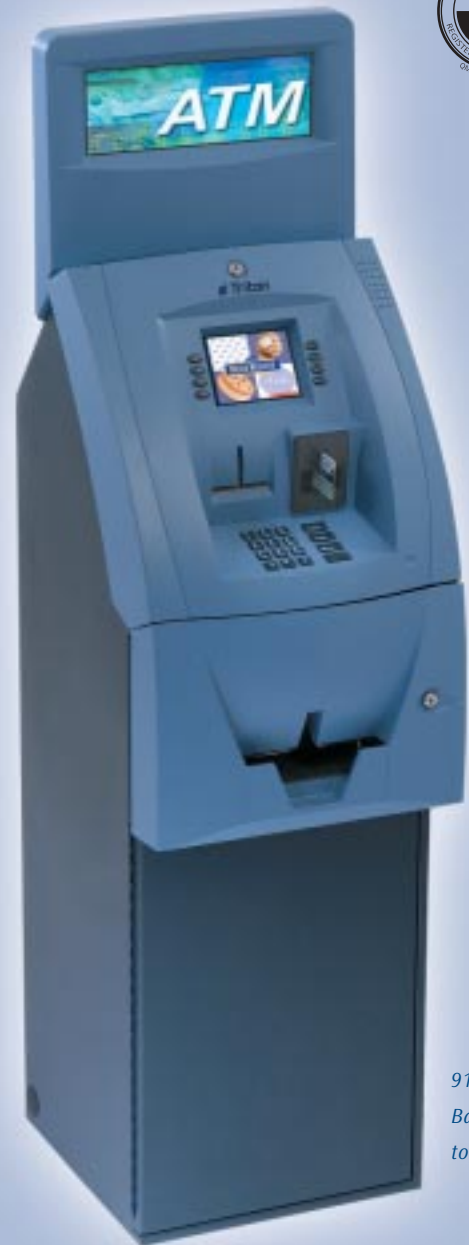
9100 with Backlit topper