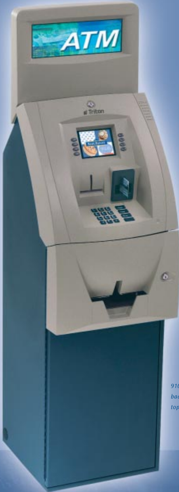
9100 with backlit topper

The 9100 is our best selling ATM. This extremely popular machine was designed to be the lowest cost high-performance ATM in the industry. And it has proven to be perfectly suited for owners who need functionality and performance at a lower price point.